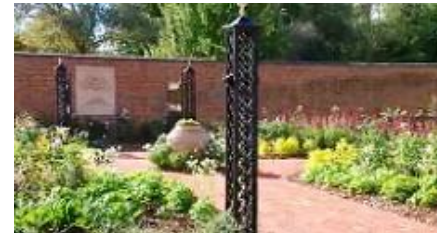
Image: Legacy Gardens OU Campus

To listen to the full edition (approx. 17 minutes) click here .