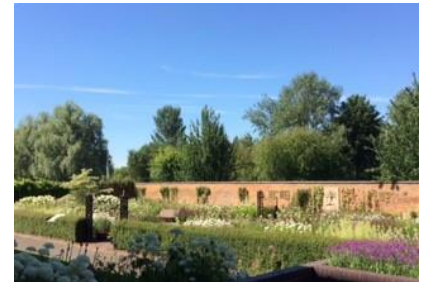
Image: Legacy Gardens OU Campus