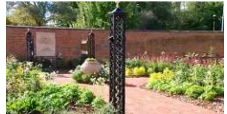
Image: Legacy Gardens OU Campus